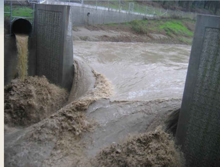
Regional Flood Protection